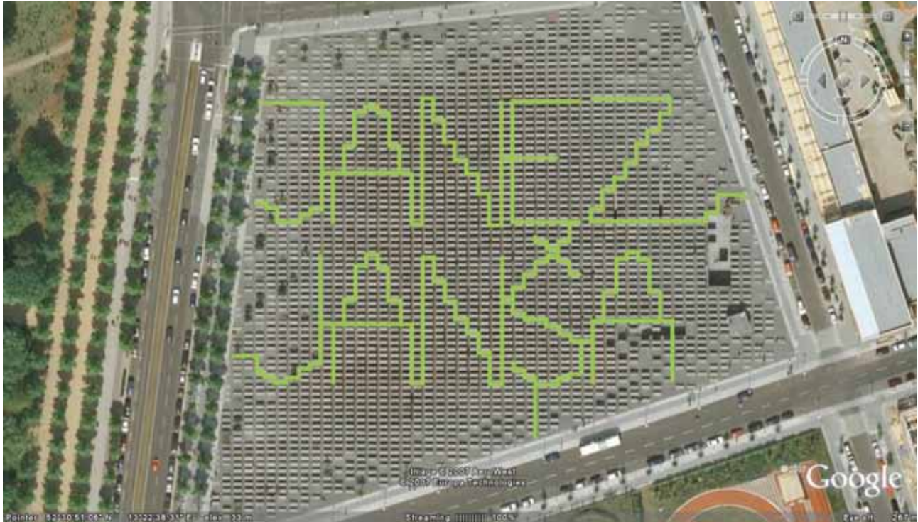
Janez Janša, Janez Janša, Janez Janša. Signature Event Context , Berlin, 2008. Performance (screenshot, detail).