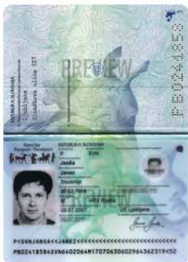
Janez Janša, Janez Janša, Janez Janša PB0241858 (Passport), Ljubljana, 2007 Booklet, spread 17.5 x 12.5 cm

objects exhibited consisted of personal documents issued by authorities (state, political party and banks) in order to claim identification, membership or other civil status of the individual. The objects presented in the gallery acquired the status of art objects by the procedure of their naming (done by the artists), by their inclusion in an art context (acted out by the gallery, curator, festival) as well as by legal expertise that claimed the objects are artefacts (enacted by a court assessor for visual art). The status of art object was added to the initial status the object had, and that was not interrupted. They also became the ready-mades. Here we come to the second difference between the classical ready-made and the objects that were exhibited at the Name Readymade exhibition. It would be unlikely that once a ready-made would leave its place in everyday reality and become an art object, it would turn back into everyday life once the exhibition would be over. Or the other way round: the object that is turned into a ready-made mostly loses its function from everyday reality. Even if someone would piss into the Fountain , that would not turn the art object into a urinal (which is anyhow deprived of the infra-