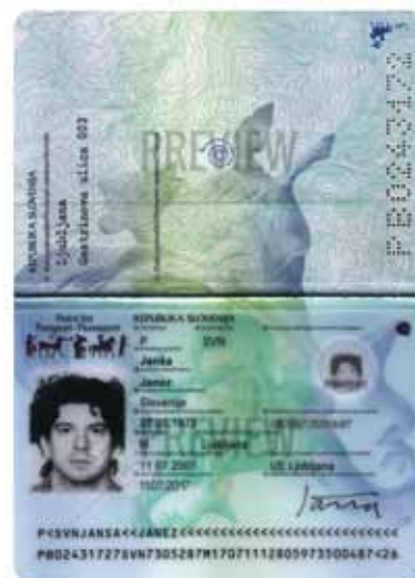
Janez Janša, Janez Janša, Janez Janša PB0243172 (Passport), Ljubljana, 2007 Booklet, spread 17.5 x 12.5 cm